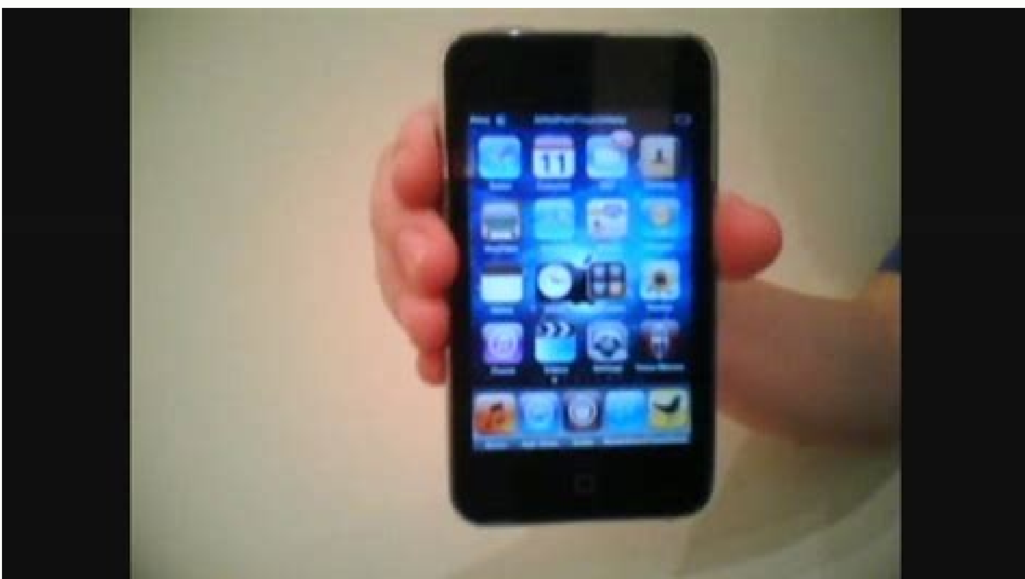
Ipod shuffle 2g manual. Ipod nano 2g manual.